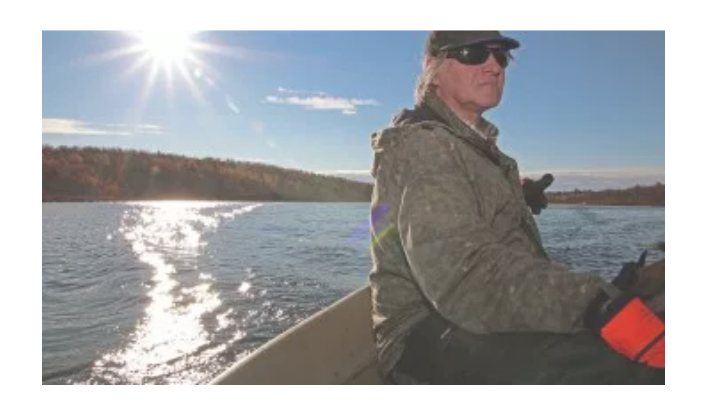
Changing With the Land: The Skolt Sámi's Path to Climate Change Resilience

The Sámi are the indigenous reindeer herders of Scandinavia. These stunning photos show a herd on its annual migration between the