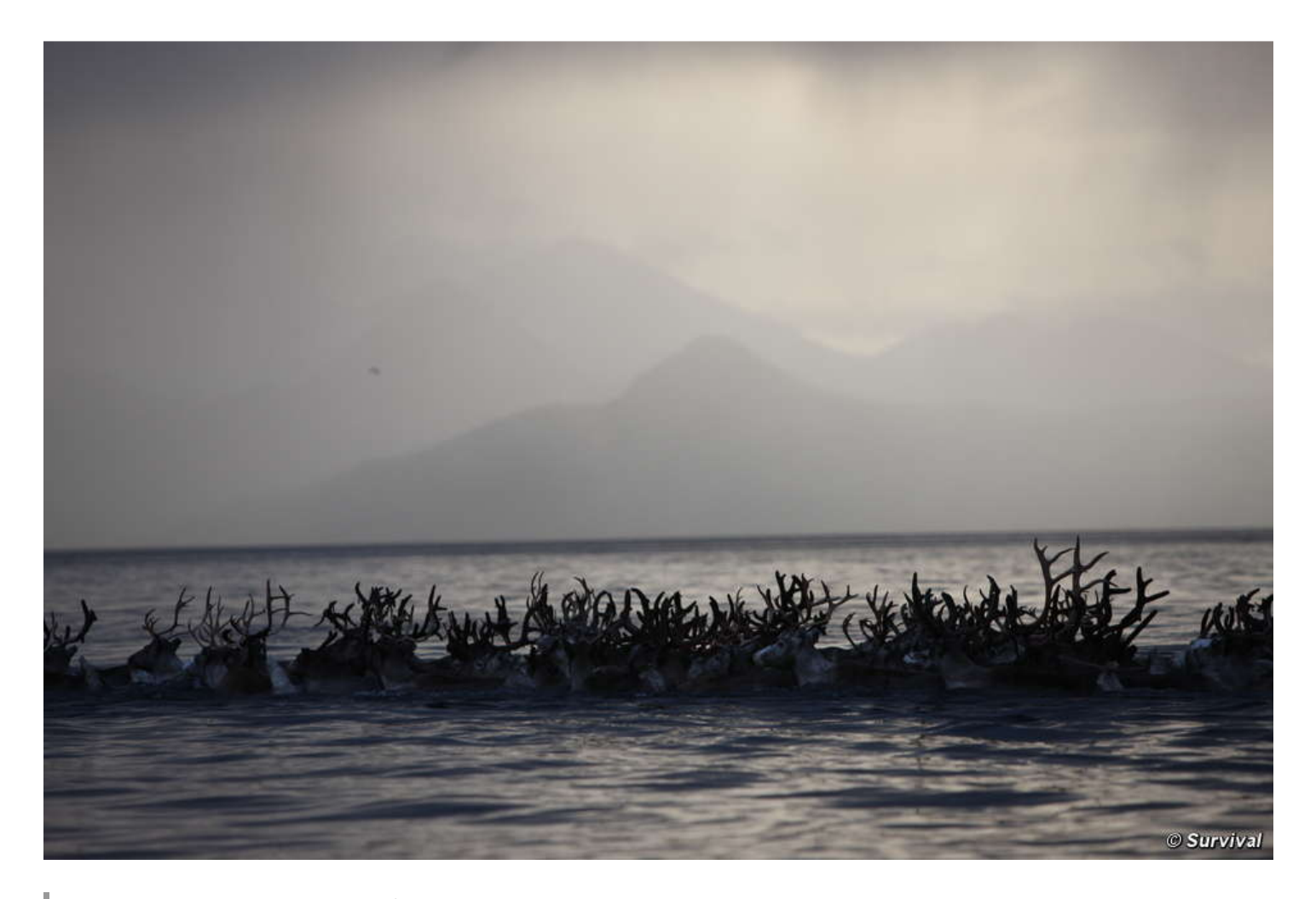
THE ARNØY / KÅGEN GROUP OF REINDEER SWIM ACROSS KÅGSUNDET FJORD FROM THEIR SUMMER ISLAND TO THE MAINLAND WINTERING GROUNDS.