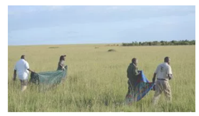
Drama in the Mara!