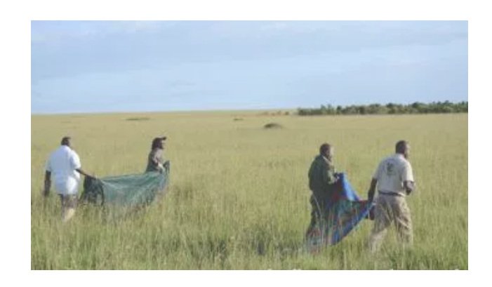
Drama in the Mara!