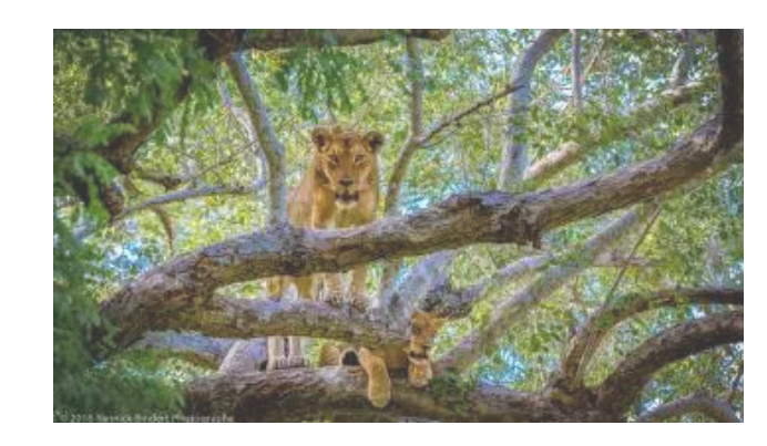
Rapid-Response Unit Saves Lions