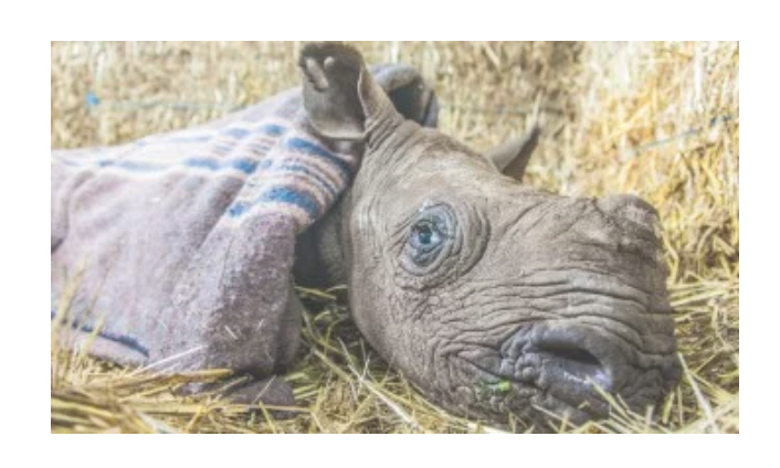
Caring for Nicky, the Blind Baby Rhino

Black rhino - Diceros bicornis were once widespread throughout Africa and Asia. The disastrous combination of a thriving illegal wildlife trade