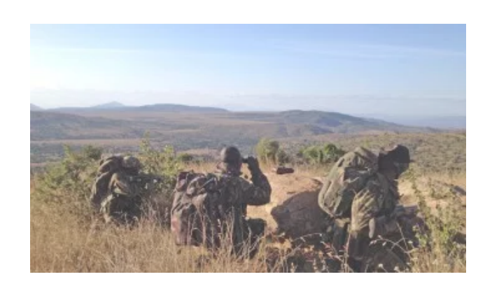
On World Rhino Day, Borana Conservancy celebrates 2